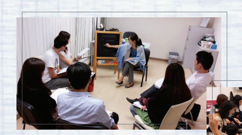
▲ 臨床心理學家為準新人進行婚前小組輔導。 Pre-marital Counselling Workshop for Couples by Clinical Psychologist.

Our Medical and Health Services have been actively developing new service area. We started pre-marital counselling last year to help couples understand each other and develop better relationship before marriage. In addition, Dietetic Service held a number of talks and workshops, and issued newsletter regularly to provide nutrition education. Our registered Dietitian also provided outreach services in elderly homes and day care centres to review their menu, provide health assessment and nutrition follow up for residents, and deliver training for health care and kitchen staff, etc.